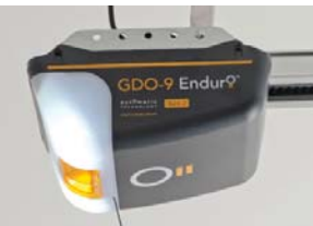
Opener with LED Courtesy Light