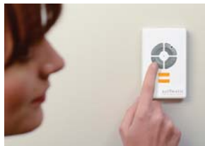
Wall mounted TrioCode™128 control panel