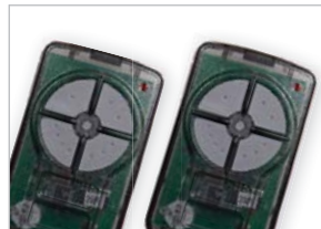
Two TrioCode™128 transmitters